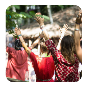
and more... come find out for your r elf.