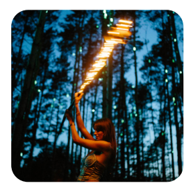
live performance therapy