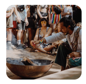
round bathr and healing artr