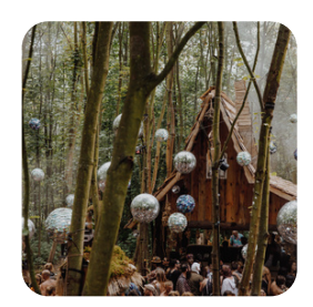
muric and dj therapy